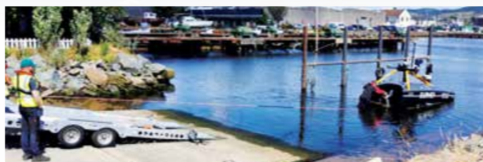
Xocean's survey vessel returning from gathering seabed data at Arklow Bank

Marine Notices published by the Department of Transport, Tourism and Sport (DTTAS) advised specific details for the various campaigns undertaken. Our appreciation is extended to the contractors and other marine users, particularly members of the commercial fisheries industry, for their co-operation during recent survey campaigns.