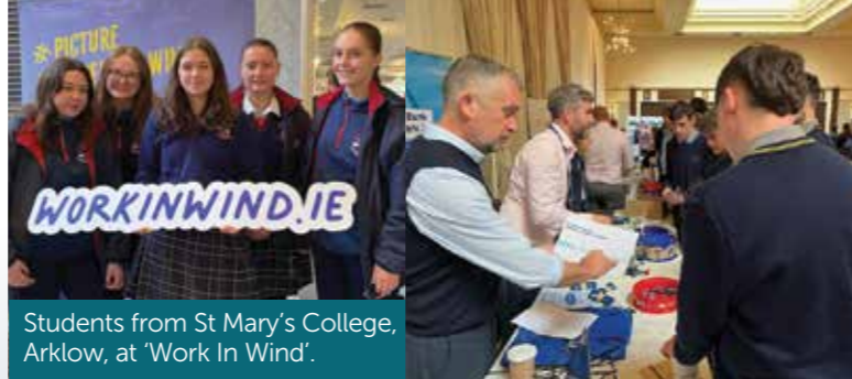
Students from St Mary's College, Arklow, at 'Work In Wind'.