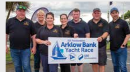
Locally based crew 'Happy Days' back on dry land after the 'SSE Renewables Mini-Regatta Race'.