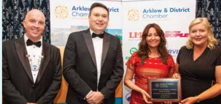
Servier (Ireland) Industries Ltd recipients of the 'Environment & Sustainability Award 2024' sponsored by SSE Renewables pictured at the Arklow & District Chamber Business & Awards event, September 2024.