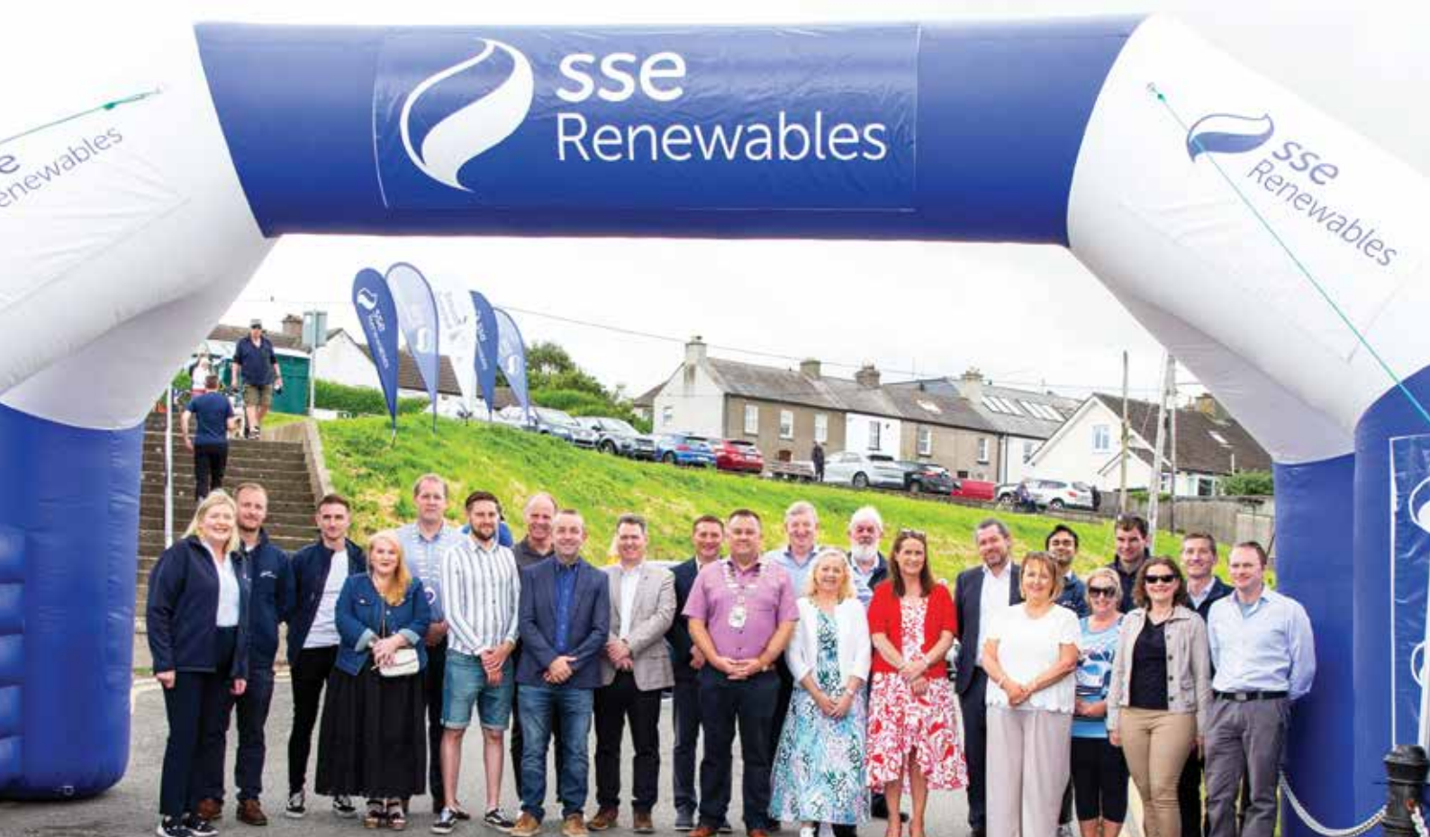
Guests gathering under the archway to await the launch of the 'SSE Renewables Round Ireland Yacht Race 2024'