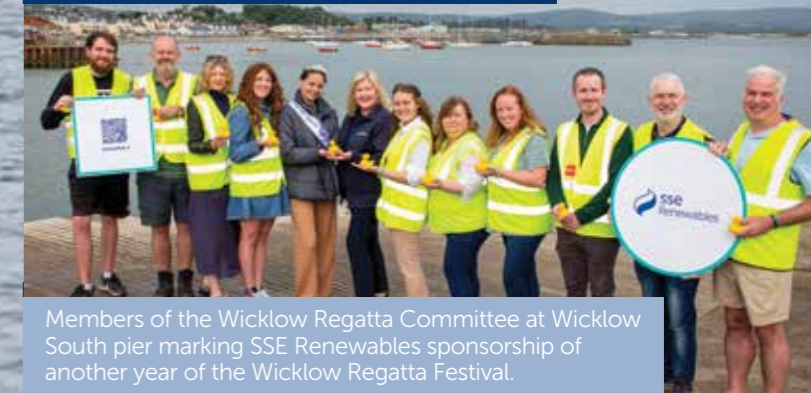
Members of the Wicklow Regatta Committee at Wicklow South pier marking SSE Renewables sponsorship of another year of the Wicklow Regatta Festival.

The Wicklow Regatta Festival is a voluntary, not-for-profit, community-run festival operating since 1878. The festival developed from the traditional August bank holiday sailing and rowing regatta days, into a large-scale community celebration now comprising over 20 events.