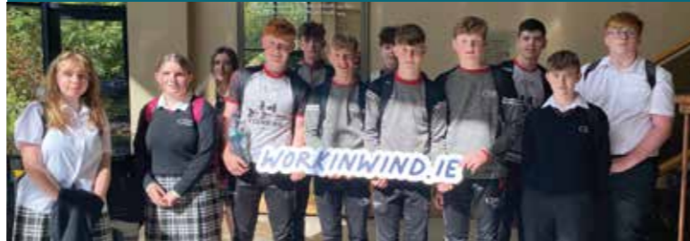
Students from Creagh College at 'Work In Wind'

In addition to chatting about SSE Renewables early careers' pathways, we shared information about our flagship Arklow Bank Wind Park 2 offshore project, which if consented, will bring economic investment, employment, and career opportunities to the Wicklow and Wexford region, drive the transition towards a cleaner, more sustainable future for these and other young people. Our 3-D simulation of the Arklow Bank Wind Park 2 offshore development site garnered particular interest on the day proving to be a big hit with the students who took time to visit our exhibition stand.