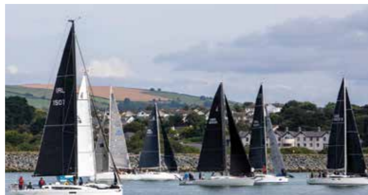
Vessels making ready for the first ever 'SSE Renewables Arklow Bank Yacht Race 2024' in association with Arklow Sailing Club