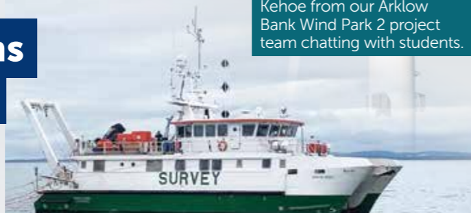
Green Rebel's 'Roman Rebel' completing survey work to collect high resolution geophysical data at the Arklow Bank 2 offshore development site.

A first for Arklow Bank Wind Park 2 was the use of Xocean's uncrewed survey vessels to collect site data at Arklow Bank. Xocean's vessels gathered data which was transferred via satellite link to onshore operators and data analysts. Geophysical campaigns concluded ahead of schedule and the data captured will augment existing information to inform project refinements to the offshore site area. An additional benthic (seafloor ecology) survey takes place in October undertaken by Wicklow's Alpha Marine and Aquafact. The survey will involve the use of Drop-Down Video (DDV) to record footage of the seafloor and the lowering of a day grab to take sediment samples.