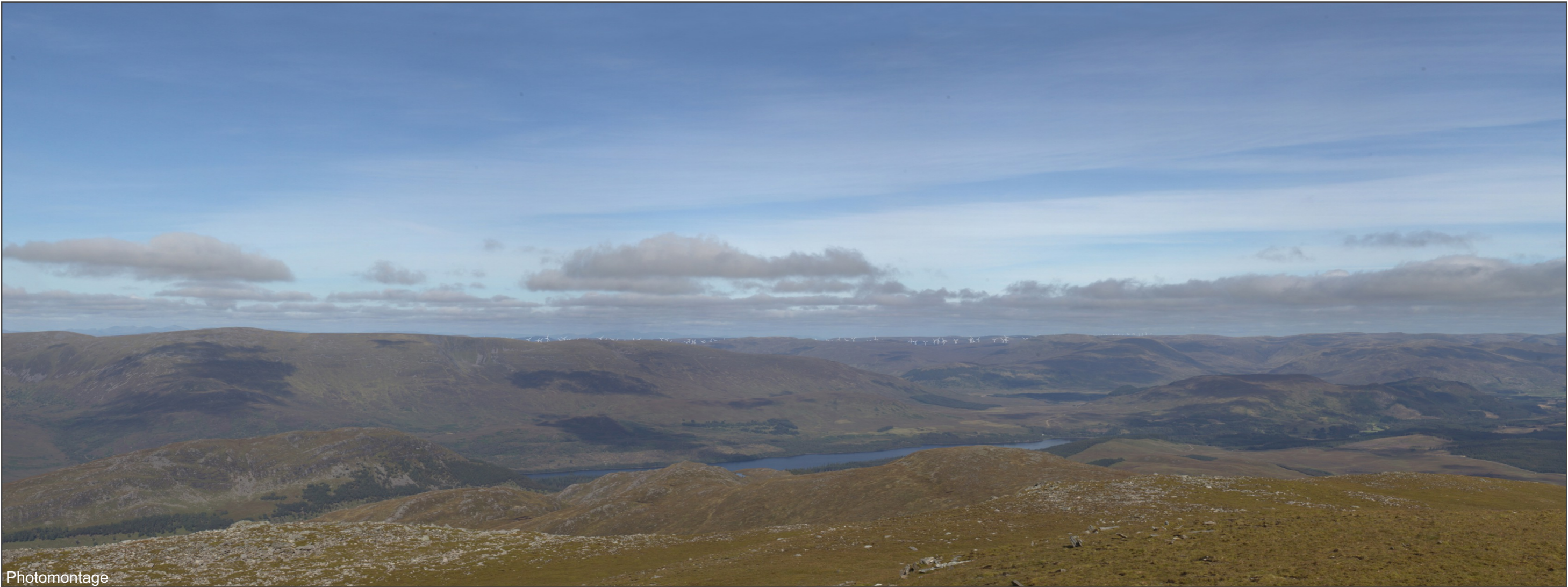
FIGURE 3.9.7.2 - VP13: Geal Charn (Ardverikie)

OS reference: 250441 E 781229 N Distance to development: 20.3km Ground level: 1040.76m AOD Direction of view: 4.89° Camera: Canon EOS 5D Mk II Focal length: 50mm vertical (27°) x 28mm horizontal (65.5°) Camera height: 1.5m Date: 07/09/2019 Time: 11:24 Drawing No. - 122011-D-V3-AI-3.9.7.2-1.0.0 Date - 26.06.2022