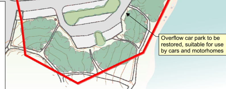
Plan (Scale 1:1,250)