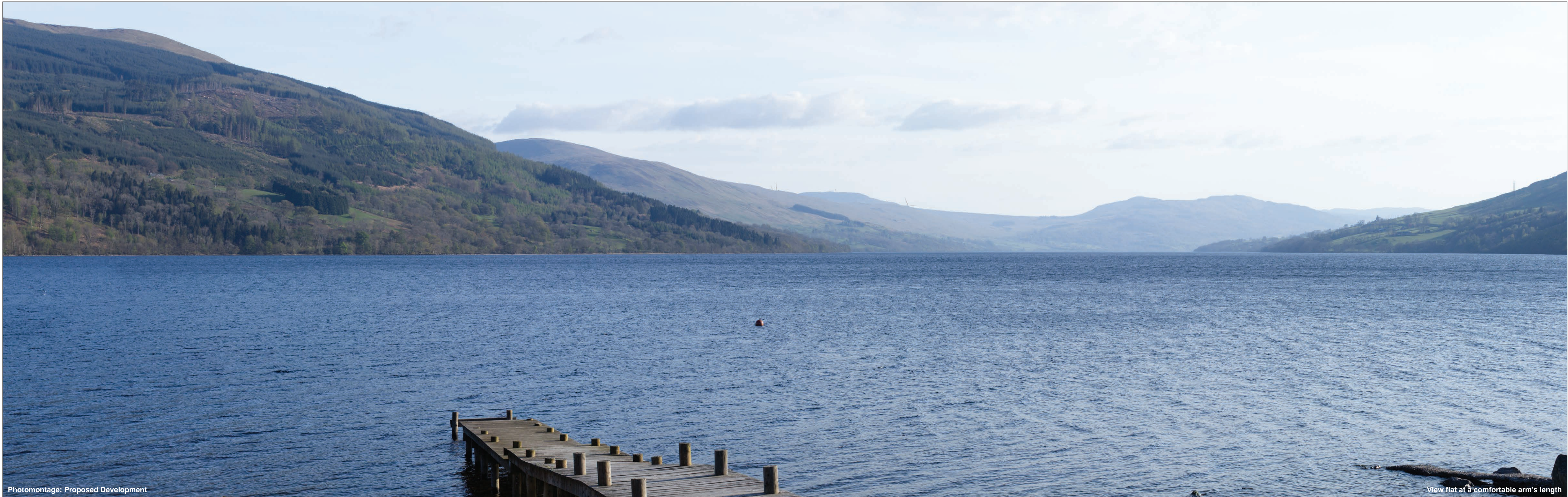
Photomontage: Proposed Development