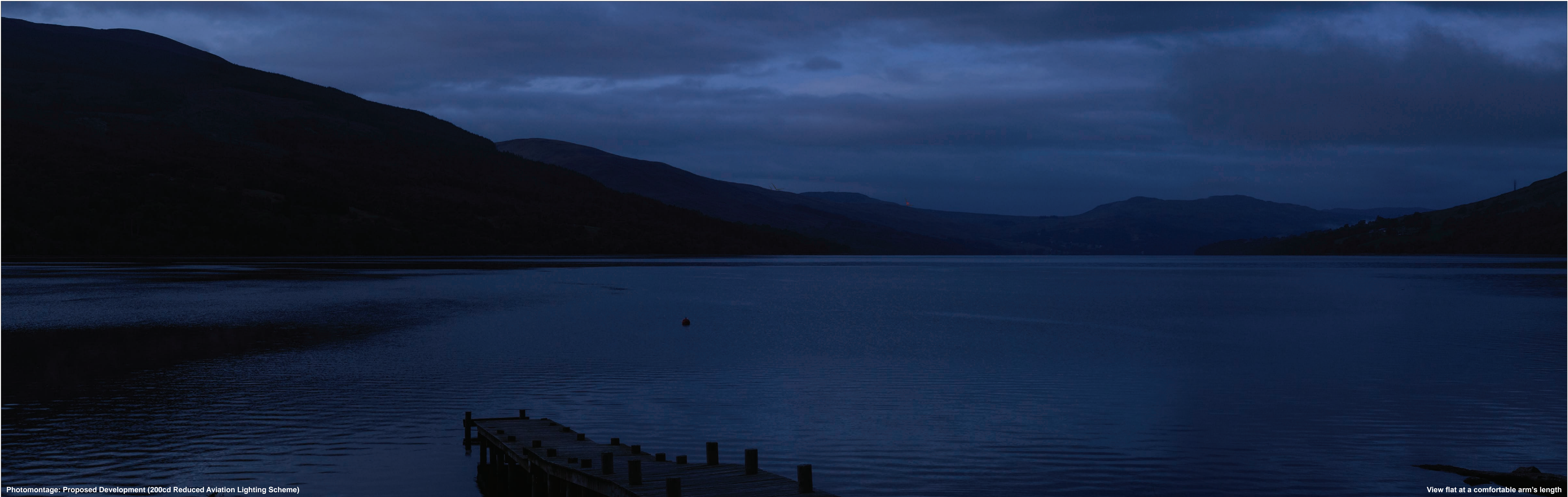
Photomontage: Proposed Development (200cd Reduced Aviation Lighting Scheme)