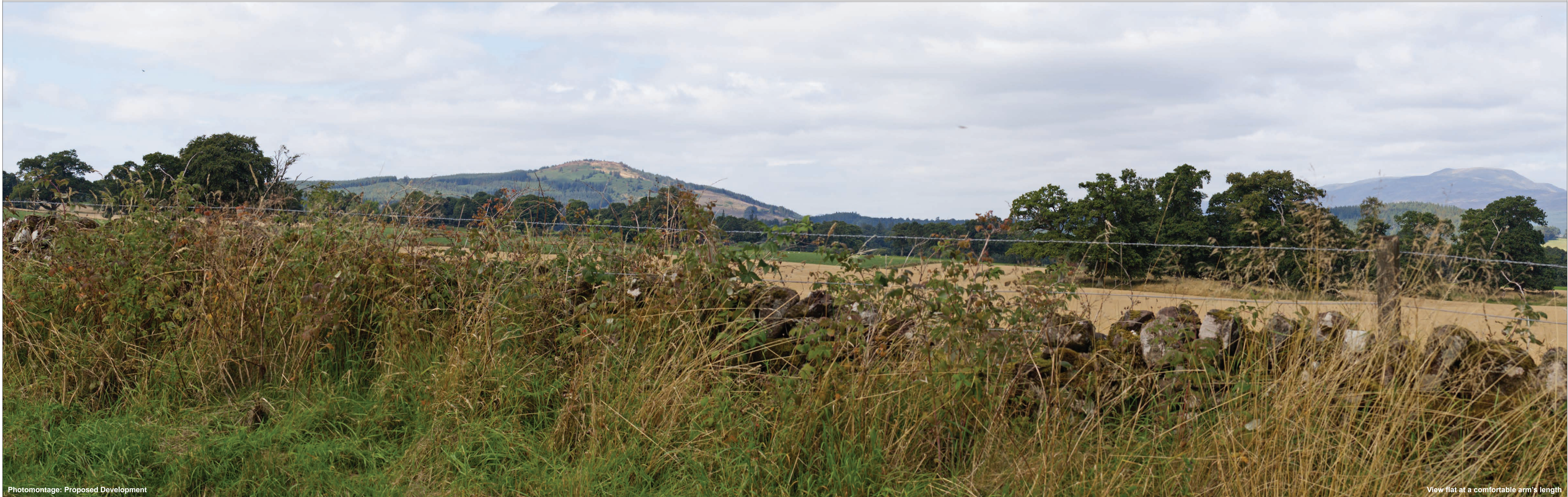
Photomontage: Proposed Development